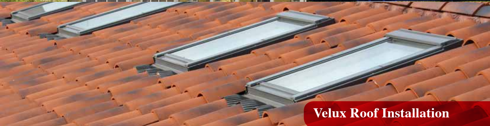
Velux Roof Installation