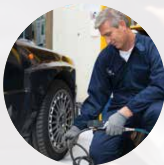
TYRE PRESSURE MONITORING