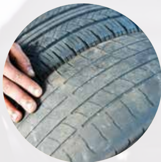
NEW & PART WORN TYRES